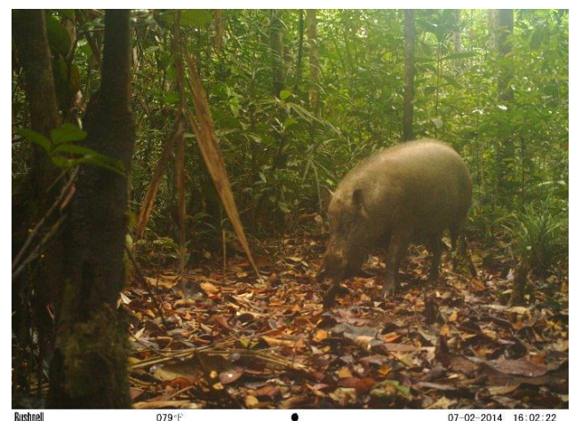
Fig. 1: A bearded pig was detected by camera trap in Bako National Park, Sarawak. This individual was photographed probably while foraging for food on forest floor.

Sus barbatus (Figure 1) is an omnivorous mammal which primarily feeds on fruits, but also roots, nuts